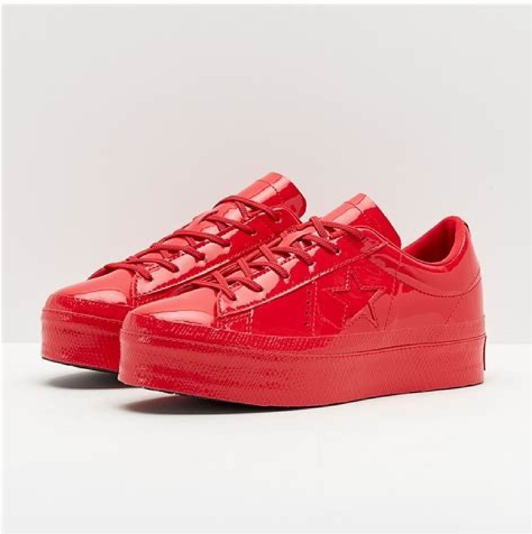
Platform jelly shoes 90s